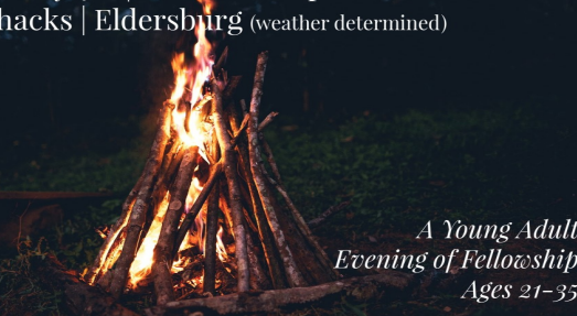
A Young Adult Evening of Fellowship Ages 21-35

Pit OR GL Shacks | Eldersburg (weather determined)