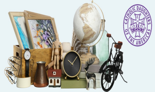
Sponsored by Catholic Daughters of the Americas Court SJCC 2300

Wednesday, June 25th 8:00 - 8:00 pm Thursday, June 26th 8:00 - 6:00 pm Friday, June 27th 8:00 - 1:00 pm