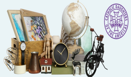
Sponsored by Catholic Daughters of the Americas Court SJCC 2300

Wednesday, June 25th 8:00 - 8:00 pm Thursday, June 26th 8:00 - 6:00 pm Friday, June 27th 8:00 - 1:00 pm